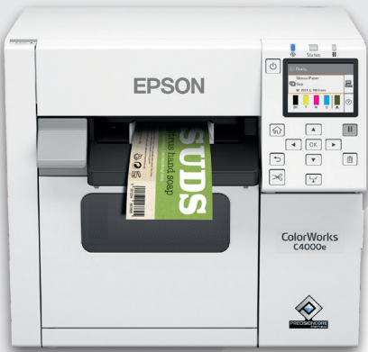
ColorWorks C4000e series